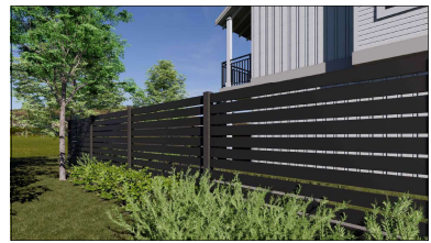
1.80 METER HIGH FENCE