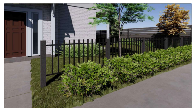
1.00 METER HIGH FENCE