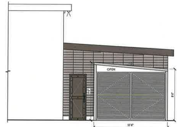
2 GARBAGE ENCLOSURE EAST ELEVATION SCALE: 1/4" = 1'-0"

BROWNS SOCIALHOUSE restaurant . bar . socialize