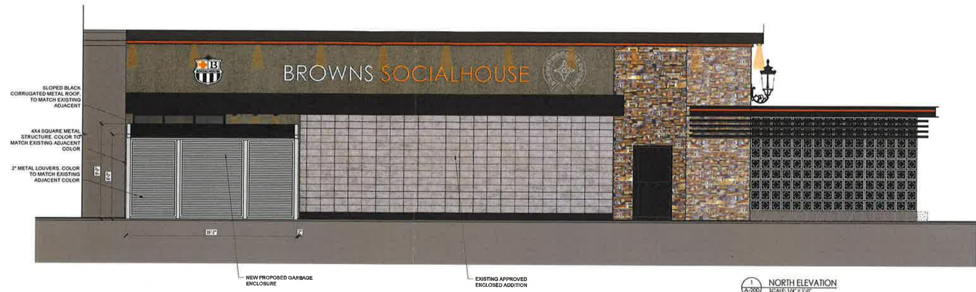
1 NORTH ELEVATION SCALE: 1/4" = 1'-0"

ALL RIGHTS RESERVED. PROPERTY OF GUSTAVSON WYLIE ARCHITECTS INC. USE OR REPRODUCTION PROHIBITED WITHOUT PRIOR WRITTEN PERMISSION. THE GENERAL CONTRACTOR SHALL REVIEW THE DOCUMENTS FOR CONFORMANCE OF CODES AND BYLAWS AND SHALL ADVISE THE ARCHITECTS OF ANY DISCREPANCIES HE MAY NOTE. THE GENERAL CONTRACTOR SHALL CHECK AND VERIFY ALL DIMENSIONS AND REPORT ALL ERRORS AND OMISSIONS TO THE DESIGNER. DO NOT SCALE THE DRAWINGS.